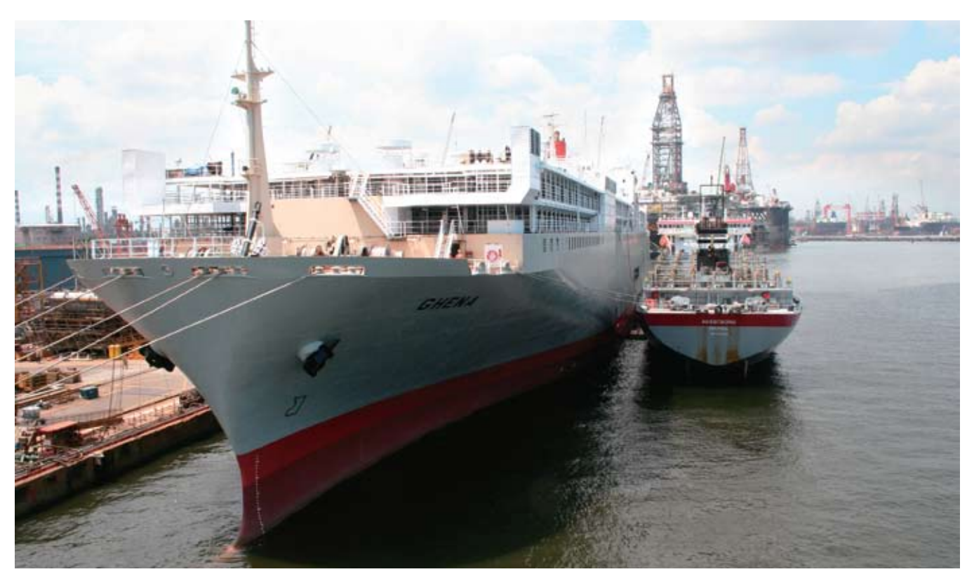
Ghena (ex-Merlion Ace) is the second livestock carrier conversion by Keppel Shipyard for Hijazi & Ghosheh

The 1984-built, 17,090 dwt livestock carrier Merlion Ace was sold as a car carrier last December by Singapore Shipping to the Jordanian company.