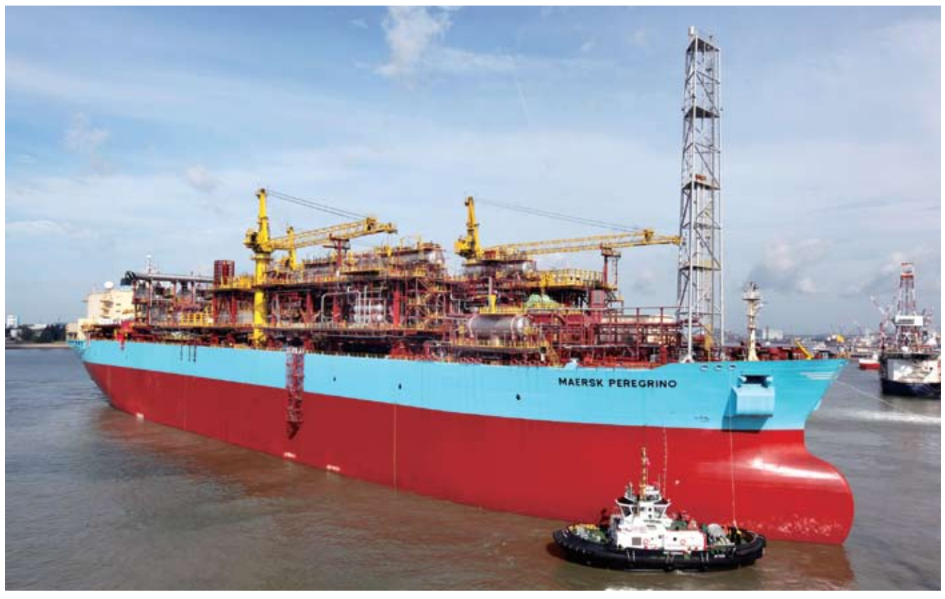
Maersk Peregrino was converted to meet Maersk FPSOs' stringent requirements which will prepare her to handle the heavy crude oil of the Peregrino field in offshore Brazil

When the ENSCO 8500 Series® is completed, Keppel-built rigs will make up a third of the leading driller's premium fleet. Construction of the next three rigs remains on schedule with expected deliveries extending to 2012.