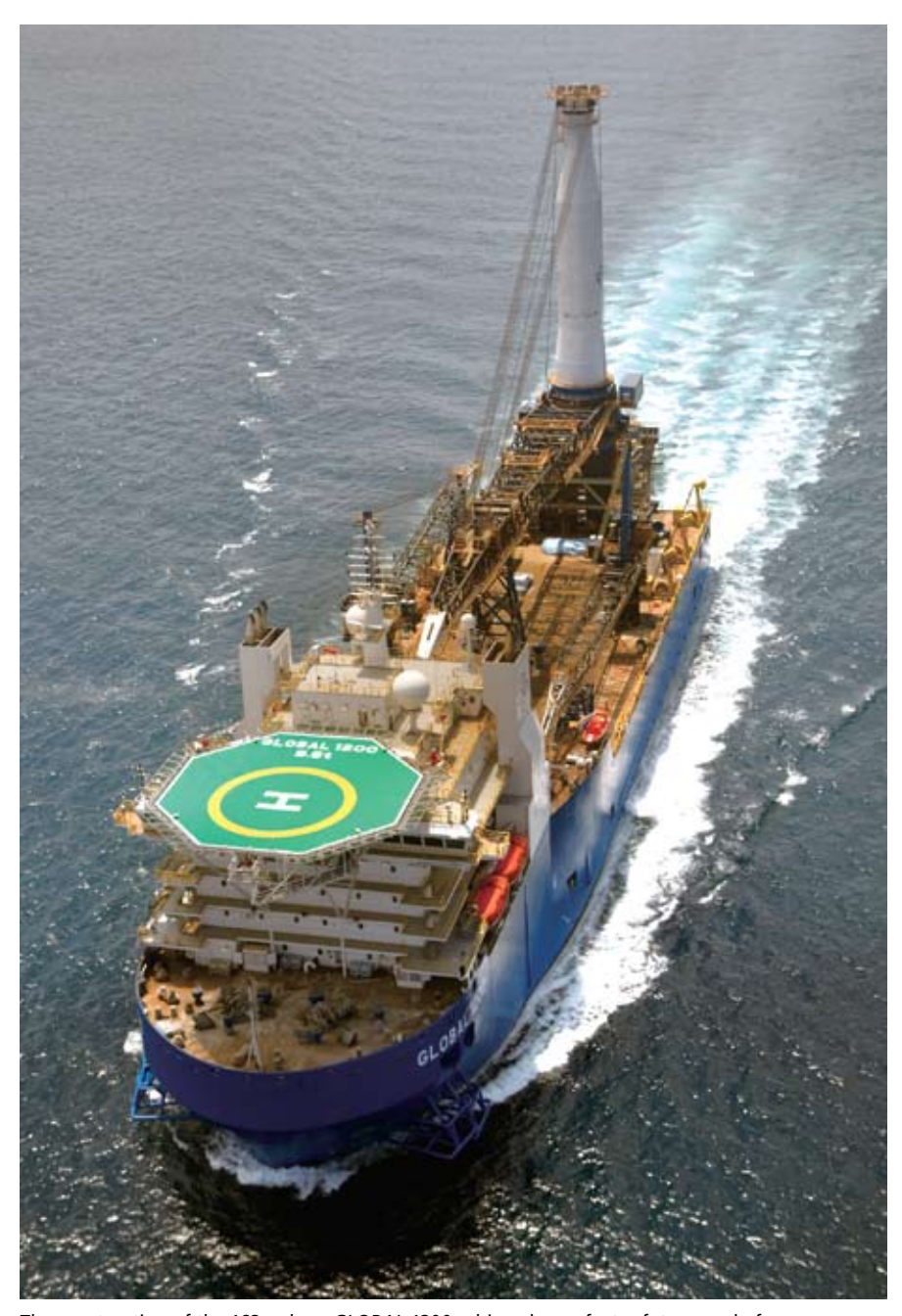
The construction of the 162 m-long GLOBAL 1200 achieved a perfect safety record of more than three million incident-free man-hours

"With a proven track record and expertise in the design and construction of specialised ships, we are well-poised to support Global, Greatship and Seaways in growing their fleet of modern, sophisticated vessels."