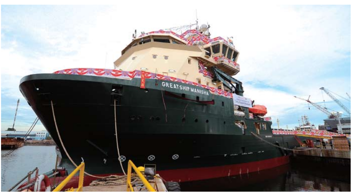
For achieving a perfect safety record on Greatship Manisha, Keppel Singmarine was awarded a safety bonus of US$10,000

The 100-tonne bollard pull vessel is equipped with dynamic positioning system, thrusters and control pitch propulsion system to enhance its position keeping and manoeuvrability. She performs terminal handling, anchor handling, escort and fire fighting duties.