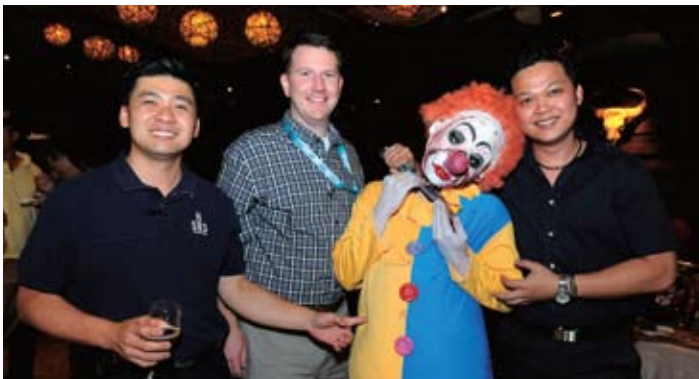
Keppel FELS and its business partners turned up in costumes under the guise of ghosts, skeletons, witches, and devils for the Halloween-themed party