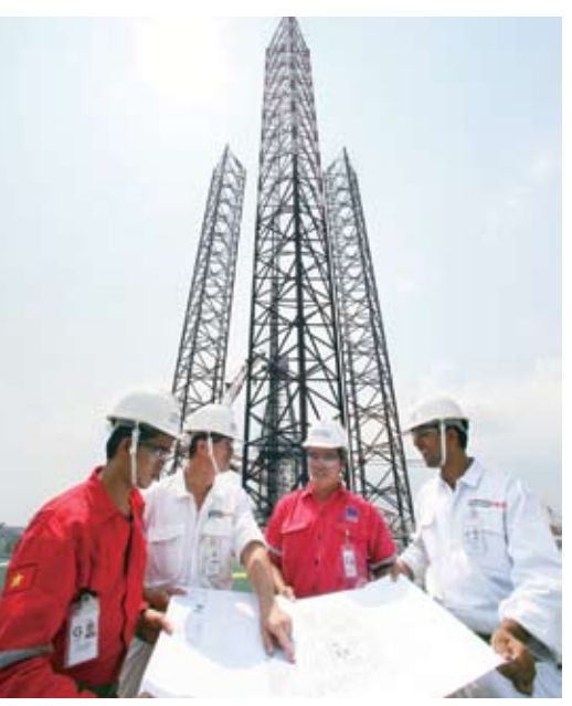
With each successive collaboration, Keppel's partnership with Vietnam reaches new heights

A special exhibition took place in Hanoi, Vietnam, to celebrate the 35th anniversary of the nation's oil and gas industry.