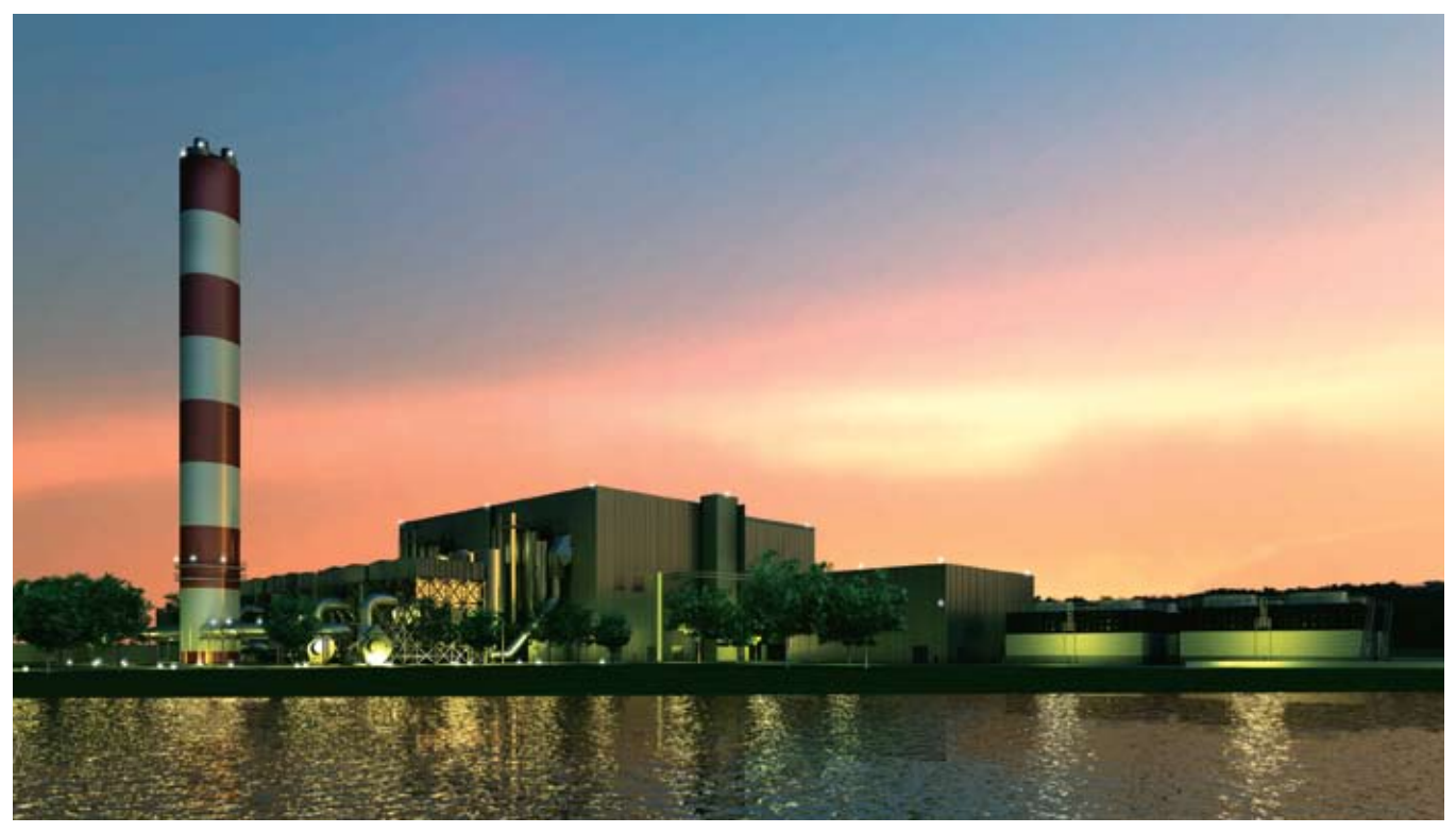
The combined Runcorn I and II plant will be one of the largest waste and renewable energy projects in the UK upon completion, with total capacity to treat 750,000 tonnes of waste per year