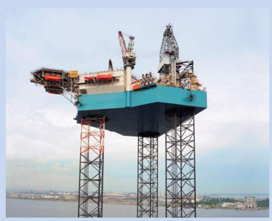
Rowan Viking, the world's first KFELS N Class jack up rig is already on term contract to operate in the North Sea

The KFELS N Class jackup design is the brainchild of Keppel's R&D arm, Offshore Technology Development (OTD), following Keppel's extensive experience in constructing rigs for the North Sea region since 1985.