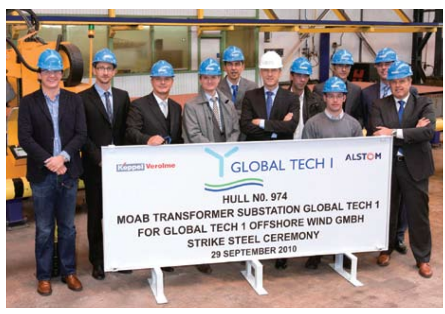
Celebrating the strike steel milestone of Global Tech 1 are the managements of Global Tech 1 Offshore Wind GmbH and Keppel Verolme