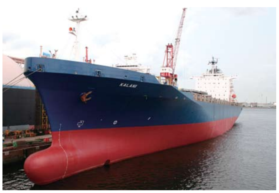
The 200th NSB vessel to call at Keppel Shipyard, Kalani is a symbol of enduring partnership between the two companies

"Our long standing partnership stems from mutual understanding and trust. We have always been able to dock our vessels at Keppel Shipyard and expect a quality vessel returned on time, or even ahead of time. It is a win-win partnership and I look forward to the 250th vessel or 300th vessel milestone."