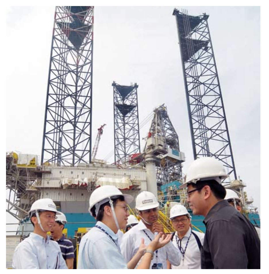
The Deutsche Bank conference participants gained better clarity of Keppel O&M's project management skills through a guided yard tour