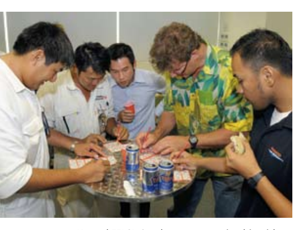
Keppel FELS's Sundowners party is a hit with customers and staff seen here playing a game of bingo

Whirling the wheel of fortune at Keppel FELS's Sundowners party brought big smiles to customers and staff on 23 April 2010.