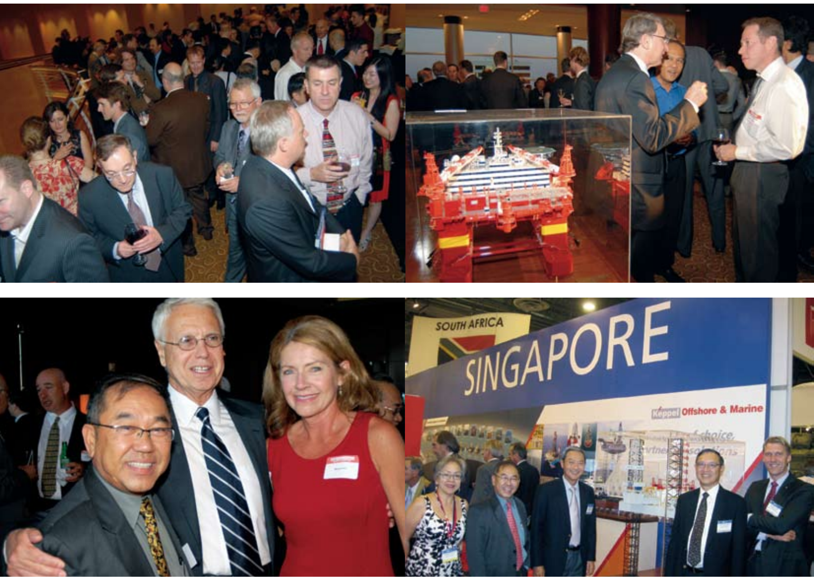
Industry magnates worldwide renew ties and forge new partnerships at the 2010 Offshore Technology Conference and Keppel cocktail reception

Some 72,000 people, including offshore energy industry experts from 110 nations across the globe, flocked to the world's foremost event, Offshore Technology Conference (OTC) in Houston from 3-6 May 2010.