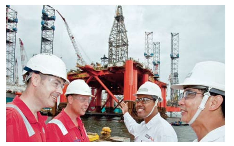
Project teams from Stena Drilling and Keppel FELS worked hand in glove to restore Stena Clyde to tip-top condition