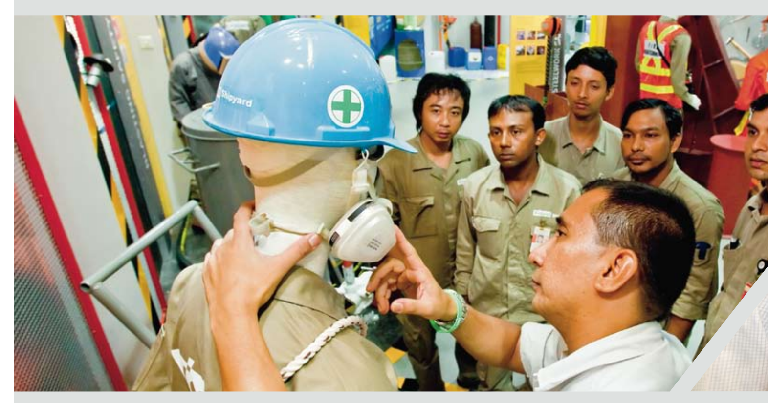
Guided by experienced trainers, the new safety training facilities provides a conducive learning environment for the workforce