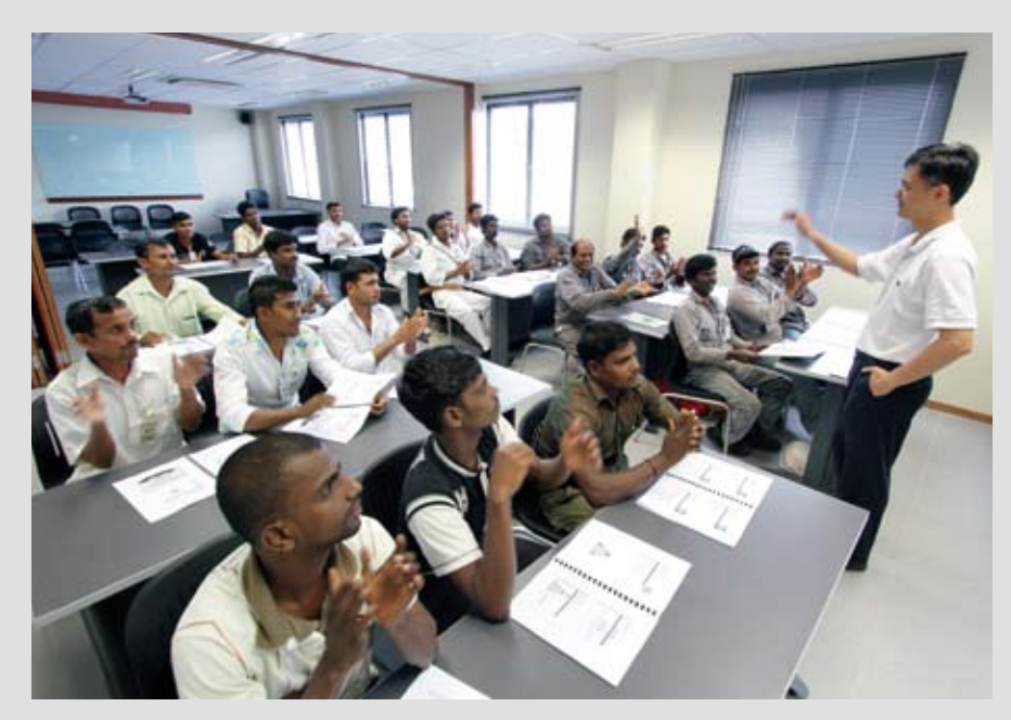
Dedicated and professional trainers help impart safety ownership and facilitate lively discussions

SBM, Shell, Prosafe Production, BW Offshore, Woodside, Statoil, Maersk FPSOs, BP and Frontier Drilling.