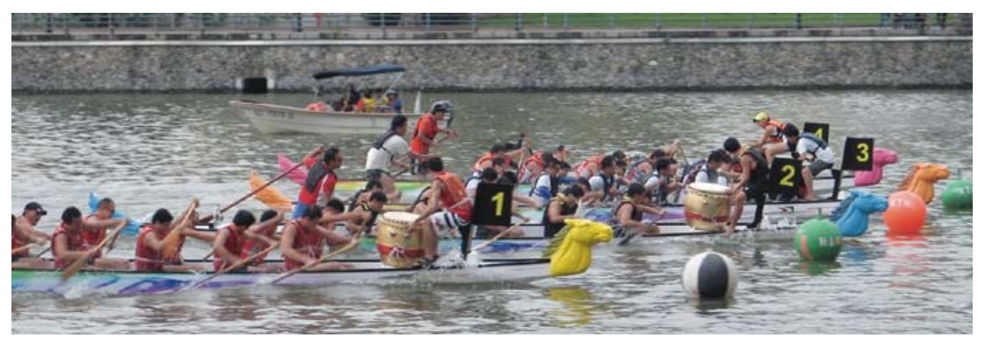
The Keppel Dragons team emerged winner at the Gallop of the Dragons 2010 race in May 2010

emerge champion against their tough opponents.