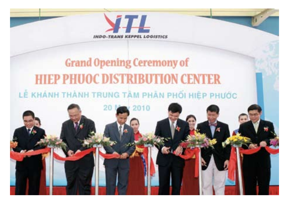
The opening of the new Hiep Phuoc Distribution Centre will enable Keppel T&T to serve the urban and industrial regions in Vietnam better