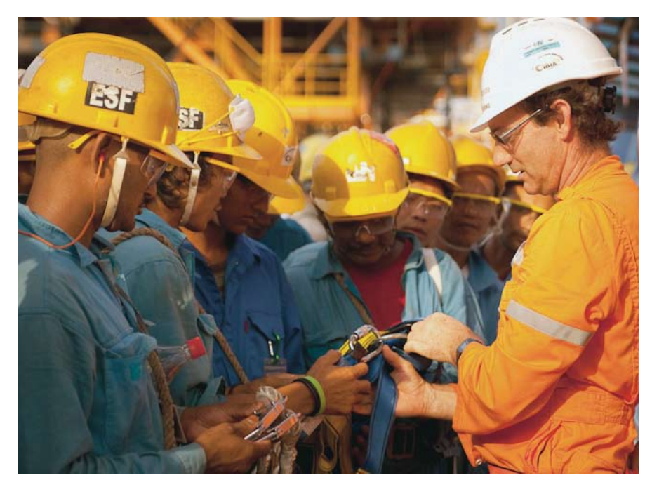
Keppel Shipyard's safety partner Woodside gets hands on with safety – a customer representative demonstrates the safety procedures at work