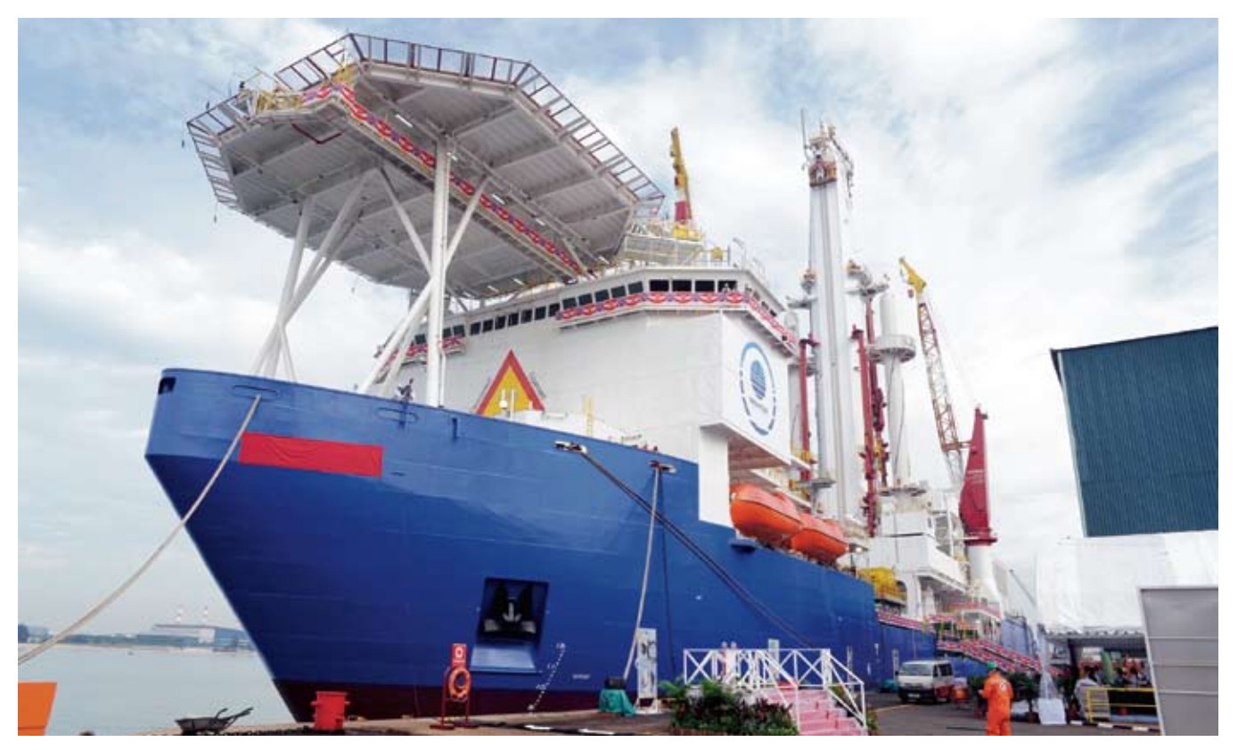
Keppel Shipyard, Frontier Drilling and Shell celebrated the naming of Bully I, which has achieved over five million man-hours without lost-time incidents to date

Keppel O&M celebrated several key construction and naming milestones with their offshore and marine customers in the months of May and June.