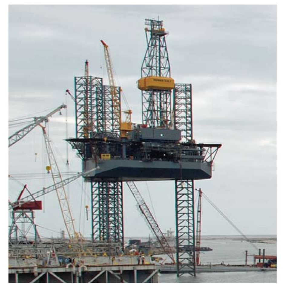
The first Rowan EXL rig delivered on time, on budget

Keppel AmFELS, the US whollyowned subsidiary of Keppel O&M, has delivered the first of four EXL rigs to Rowan Drilling Company, Inc. (Rowan) safely, on time and within budget.