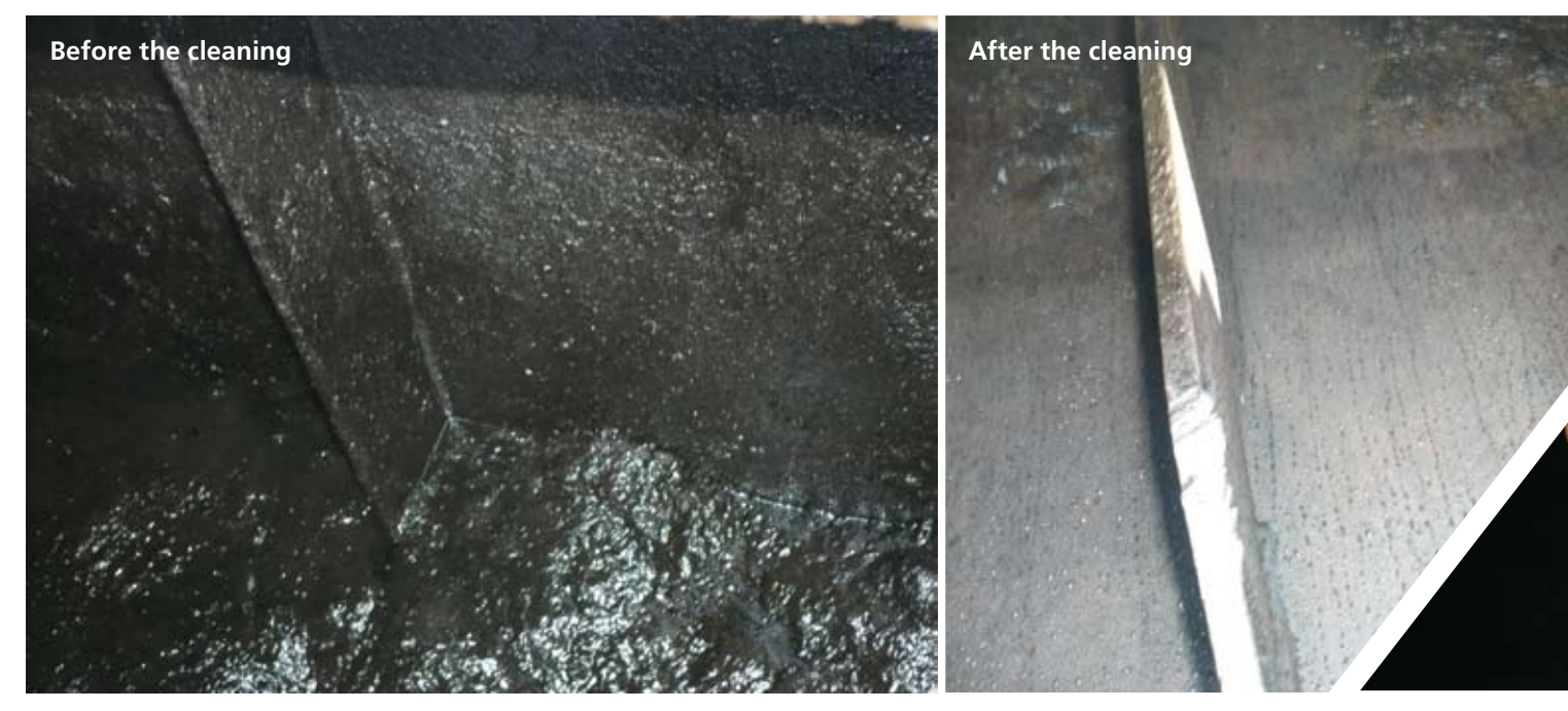
Close-up pictures of the tank surface conditions before and after cleaning using Bio-OSR