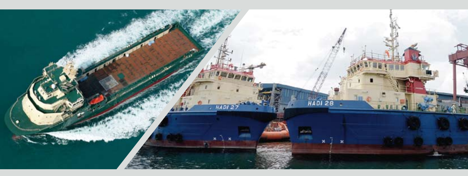
Greatship Mohini and Hadi 28 are the latest vessels delivered by Keppel Singmarine to satisfied customers

Keppel Singmarine has demonstrated its commitment to meet the needs of customers with the timely and safe deliveries of five ships.