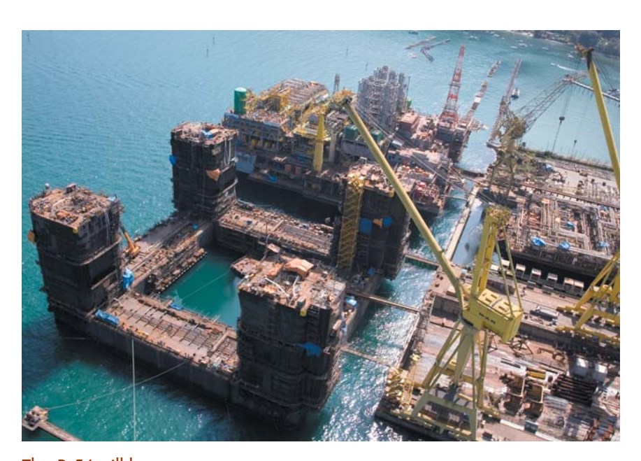
The P-56 will be a repeat of the P-51 FPU which is currently being built at Keppel FELS Brasil's BrasFELS yard

he consortium of Keppel FELS Brasil S/A and Technip Brasil Engenharia, Instalacoes e Apoio Maritimo S/A (Technip), FSTP Pte Ltd, has secured a contract to build a semisubmersible Floating Production Unit (FPU) for Petrobras Netherlands BV (PNBV).