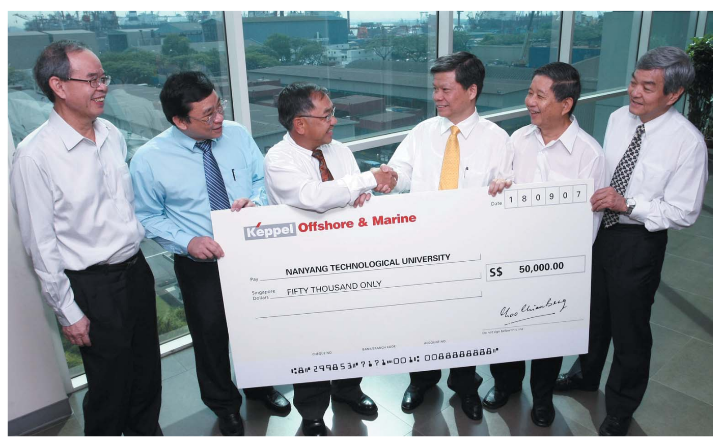
The new student endowment schemes aim to encourage more students to take up marine and engineering courses

eppel O&M has awarded more than 450 scholarships in the last year in a bid to build up and strengthen its talent pool.