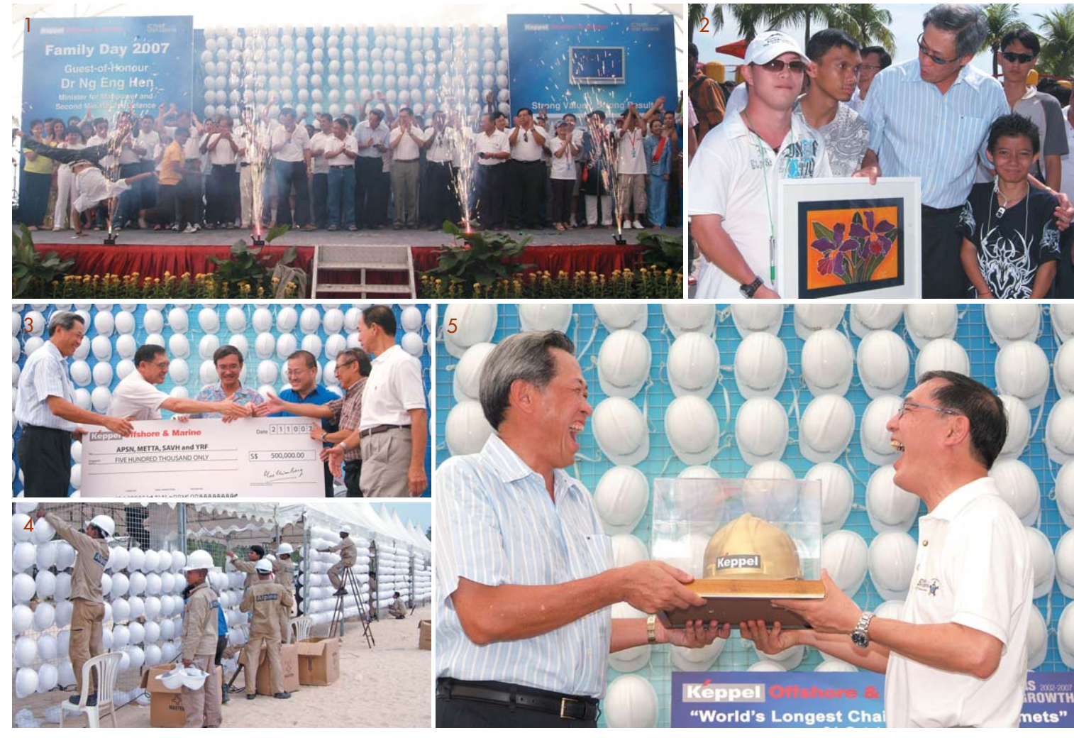
1. In celebration; 2. "Minister Ng, my friends"; 3. Giving to charity; 4. Building the wall; 5. Safety is golden