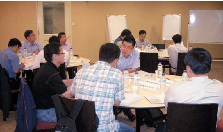
Participants of the inaugural Keppel O&M-NUS Project Management Programme