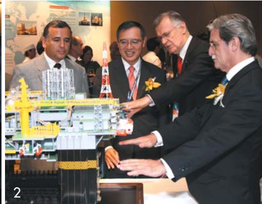
Working towards the same beat CB Choo discuss the FPU P-52's capabilities with foreign delegates at the Latin Business Forum networking reception A "sparring" performance