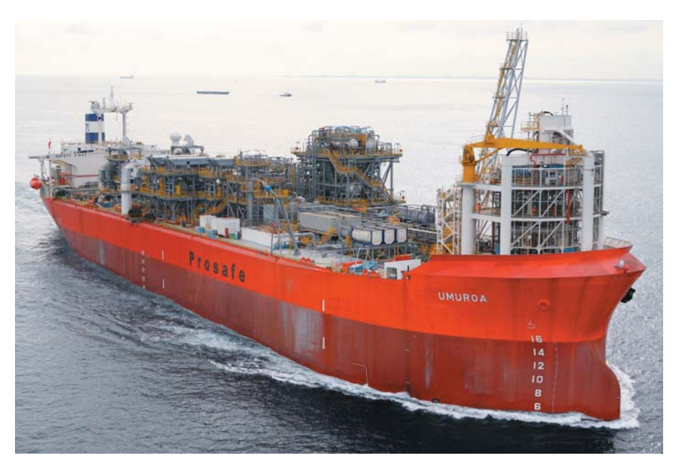
Keppel Shipyard's capability in the conversion of Floating Production Storage and Offloading (FPSO)/FSO vessels is recognised by owners and operators. It has completed three such facilities this year. Shown above: FPSO Umuroa has been delivered to Prosafe Production

eppel Shipyard has been awarded two conversion contracts one by Prosafe Production Pte Ltd, and the other by Shipping Logistics Incorporated for a long term charter to Perenco S.A. (Perenco)