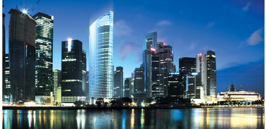
Ocean Financial Centre

Keppel Corporation 's embrace of good corporate governance has won it further accolades. The company secured top honours for corporate governance and transparency at the Securities Investors Association's (SIAS) 8th Investors' Choice Awards on 4 October 2007.