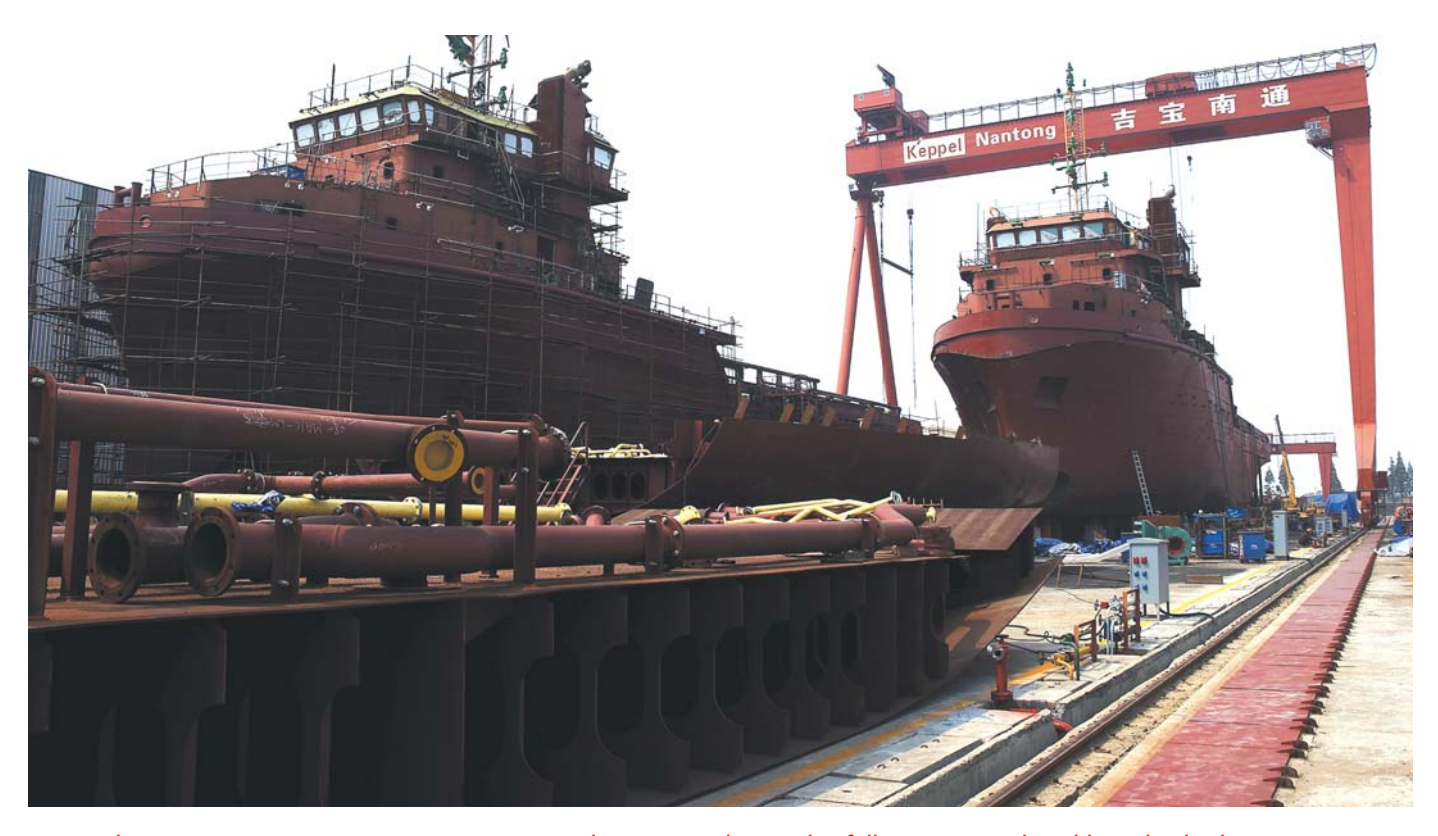
In just about two years since its acquisition, Keppel Nantong Shipyard is fully operational and has clinched contracts to build 26 offshore support vessels and tugboats

eppel Nantong Shipyard (Keppel Nantong), has clinched three contracts to build eight vessels.