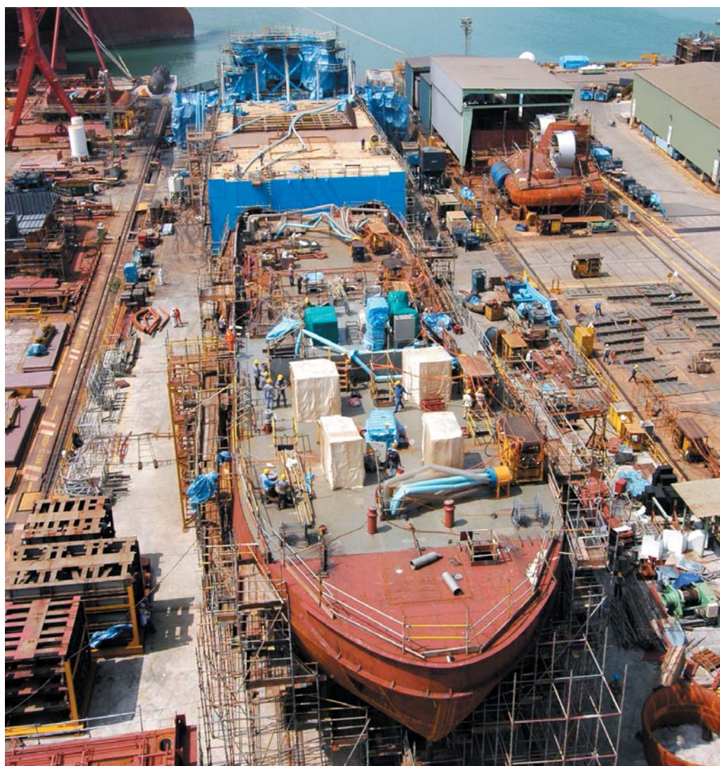
An icebreaker is shown here under construction at Keppel Singmarine's Benoi yard

Greatship Global Offshore Services is wholly-owned by Greatship India Limited (GIL). GIL is a wholly-owned subsidiary of GE Shipping.