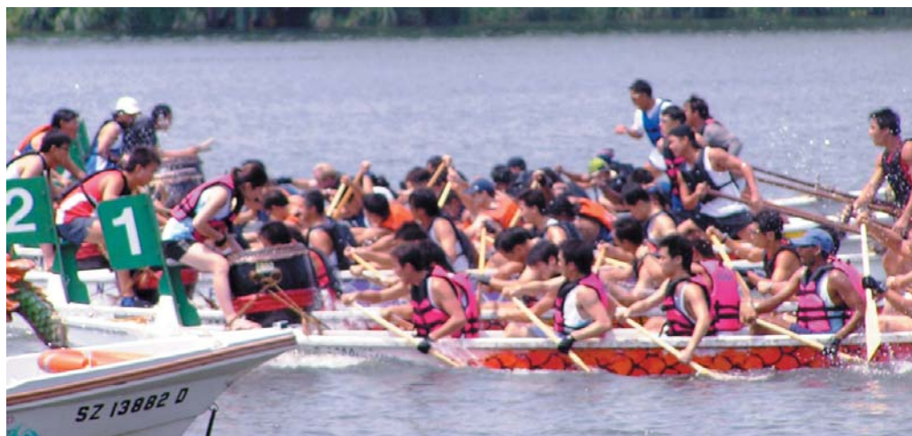
Ferocious 'dragons' slicing through the water at the eighth Jurong Island Race

Held at Lower Seletar Reservoir on 4 August this year, the JIR is an annual Dragon Boat race event.