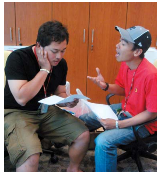
Practice makes perfect – Aspiring Keppel Idols gear up for a final pitch at the auditions