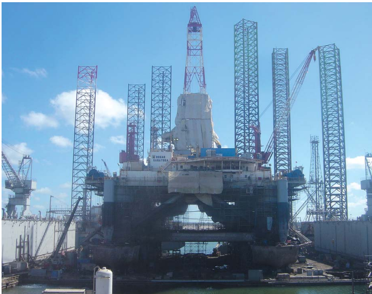
Ocean Saratoga is one of the 15 gems entrusted to Keppel AmFELS by Diamond Offshore since 1990

When completed in November this year, Pride Texas will be back working for PEMEX, the Mexican National oil company.