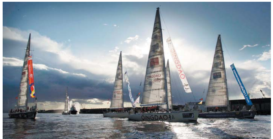
Clipper Uniquely Singapore gets into real action