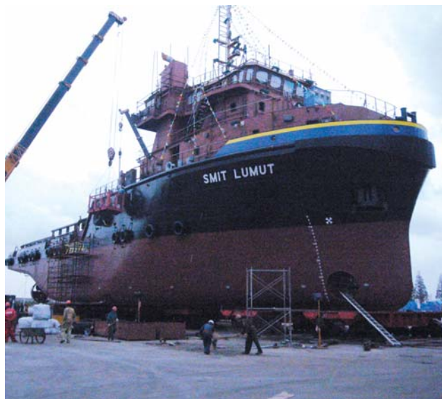
Keppel Nantong launches Smit Lumut for Hadi Offshore

K eppel Nantong Shipyard launched the first of four Anchor Handling Tug/Supply vessel (AHTS) that it is building for Hadi Offshore (HADI) on 4 September 2007.