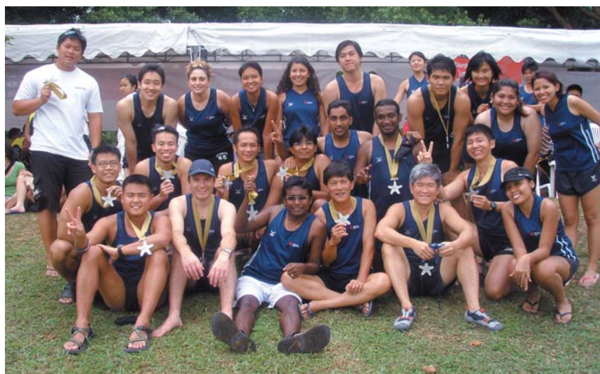
The Keppel Dragons capture silver!

Together with two other mixed teams, they