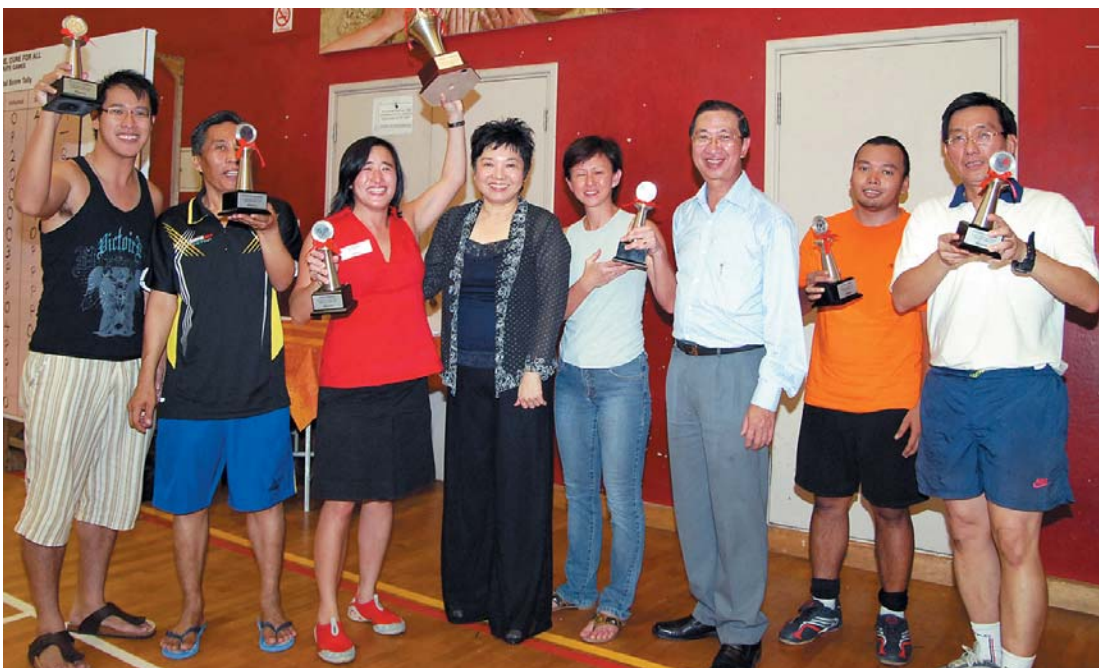
Everyone's a winner as Keppel O&M employees strike gold while supporting Singhealth's lifesaving medical research programmes

"We share its spirit of enterprise in seeking the common good of human kind."