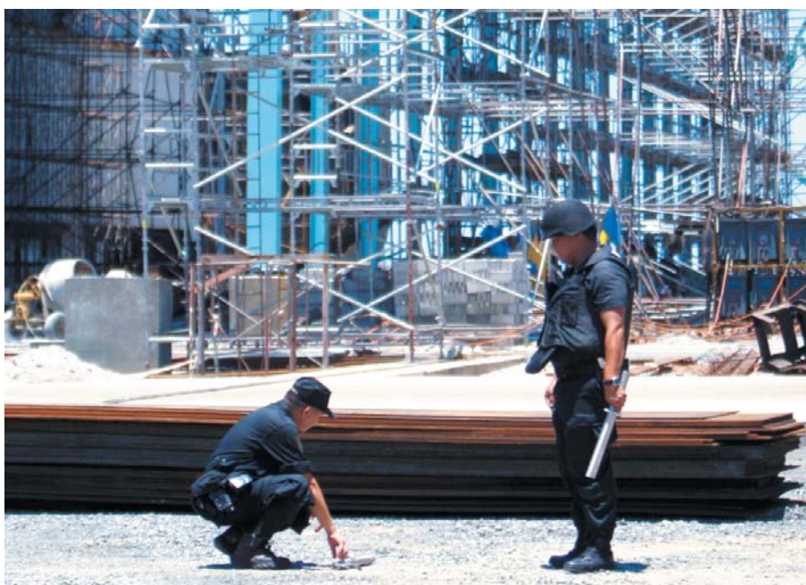
A bomb threat drill: the Manila Police District's Bomb Disposal Team conducts a search in Subic Shipyard

By 12.20pm, normalcy had been restored at the shipyard. People again went about their work empowered with the knowledge that they now knew how to react in a terrorist situation.