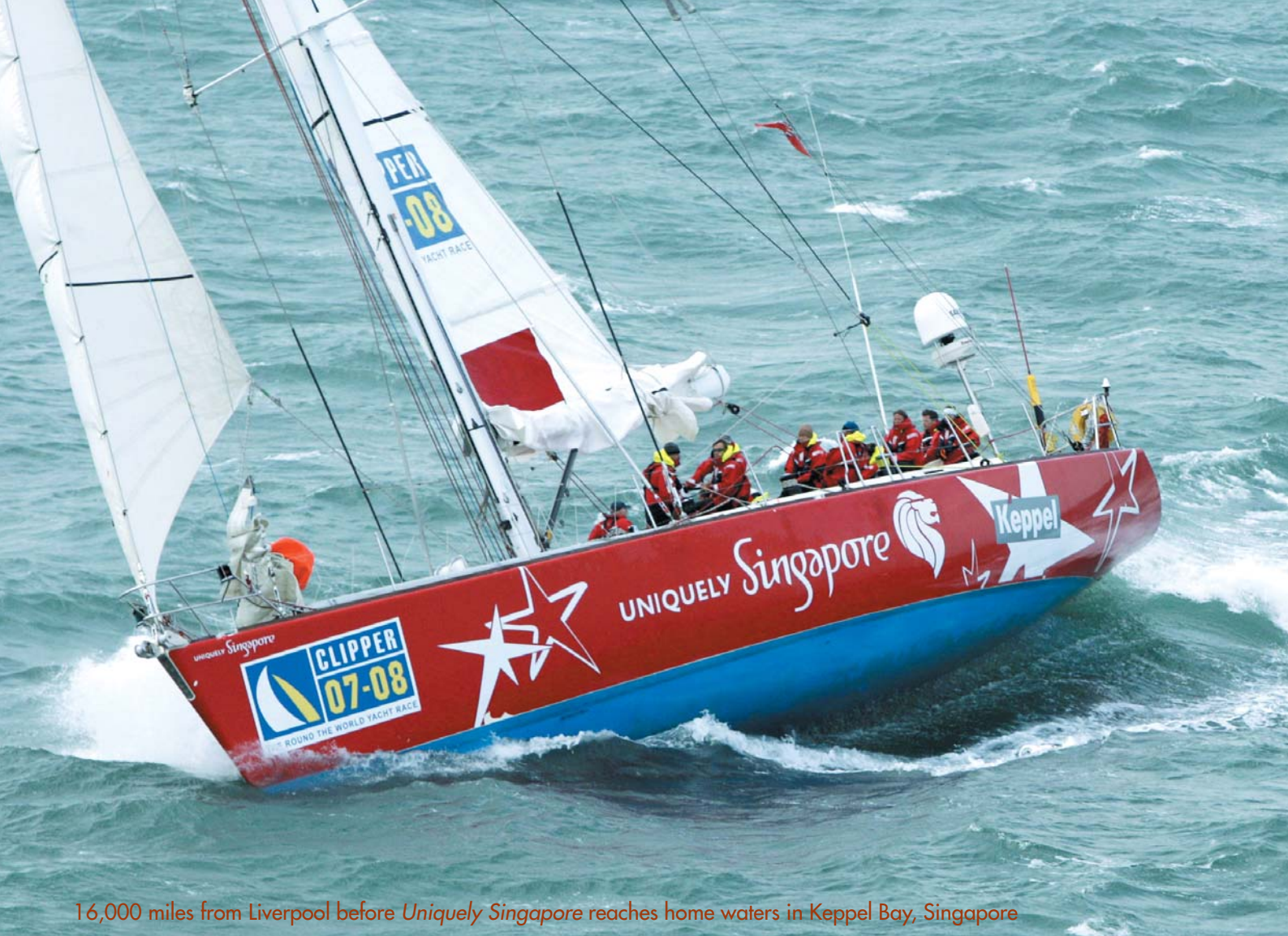
16,000 miles from Liverpool before Uniquely Singapore reaches home waters in Keppel Bay, Singapore