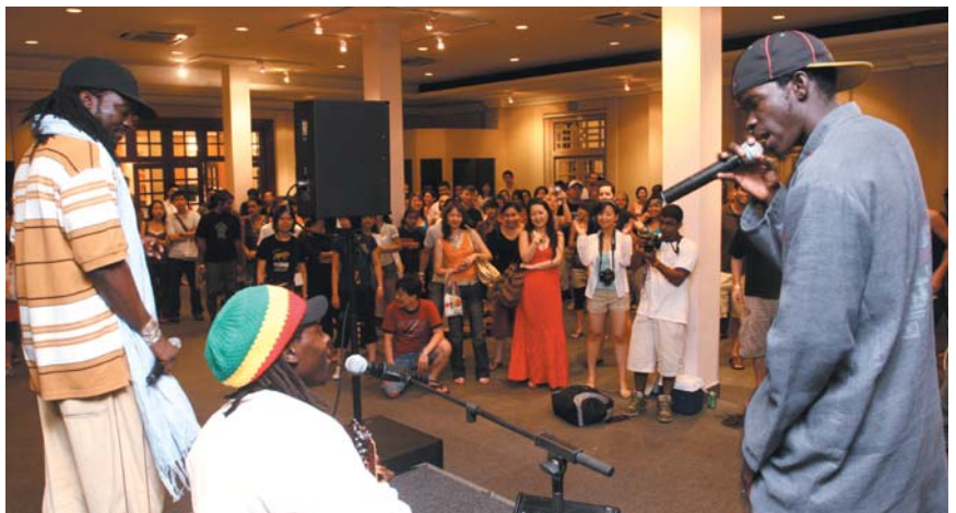
Participants croon to the tunes of Daara J