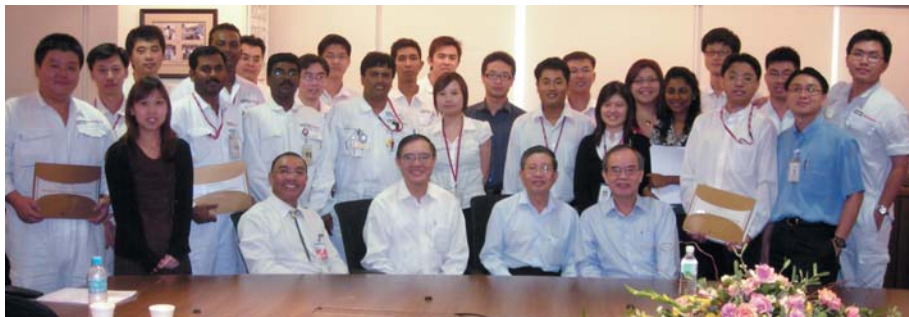
The Keppel philosophy of lifelong learning embodied by the Keppel Team

As the Keppel Group grows in numbers and strength, it is bolstered by Keppelites of all ages – from undergraduates to industry veterans and re-employed retirees. Beyond the years that mark their differences, they continue to find personal and professional satisfaction in their careers at Keppel.