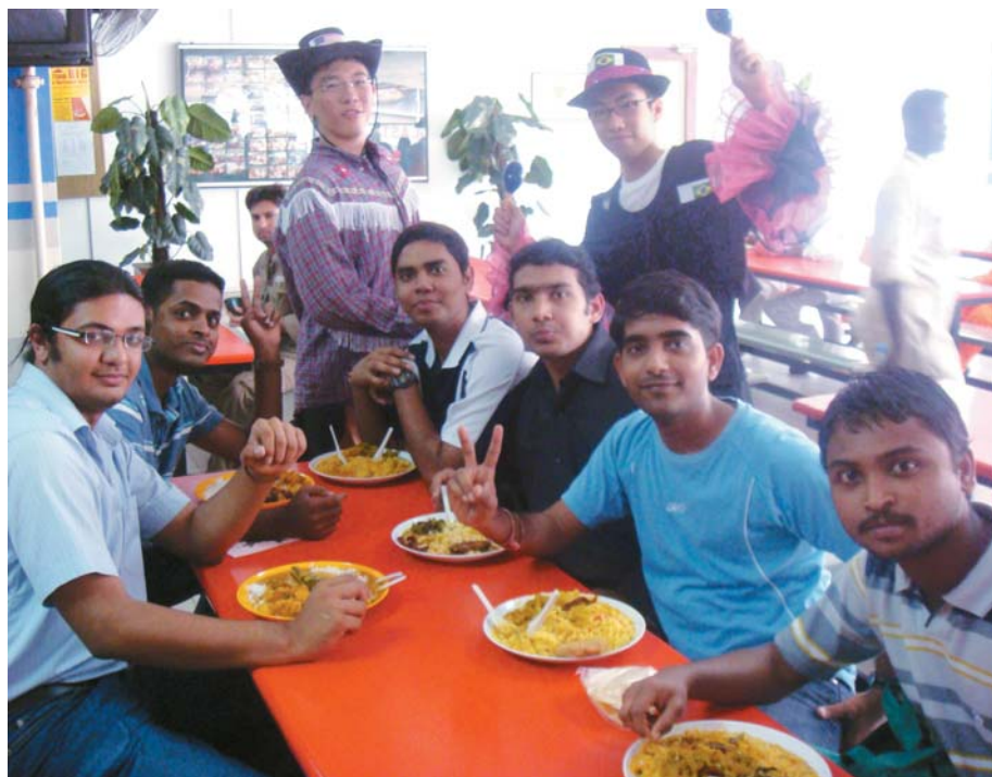
Shooting stars – Keppelites get to pose with their favourite roving actors for a small contribution to charity

And yes, the best is what we can expect from World of Friends , created by Keppelites for Keppelites. Stay tuned for 21 October 2007 when the real action and excitement unfolds!