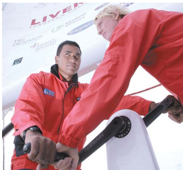
Havin' a Clipper good time!