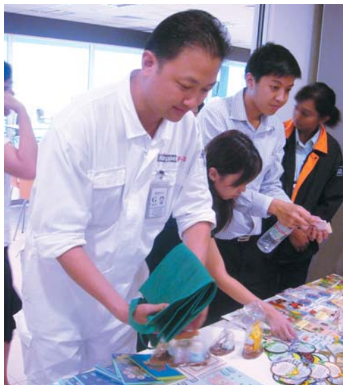
Lending a helping hand for charity

Keppel O&M's very own song – We Can Do – was the sum of efforts from its budding musicians and lyricists who contributed their ideas and inspirations to create a tune that would capture the spirit and energy of Keppelites.