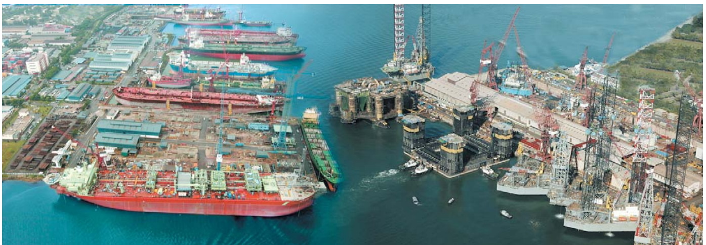
Keppel O&M is 'Technology Pioneer' at the Offshore Energy Center's Hall of Fame

world's oceans through public educational programmes. It also operates the Ocean Star , an offshore drilling rig and museum in Galveston, Texas, which chronicles the unique heritage and technological accomplishments of the offshore industry.